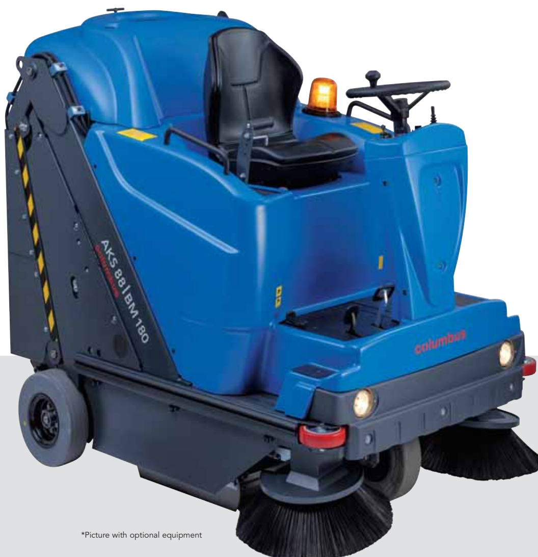
*Picture with optional equipment