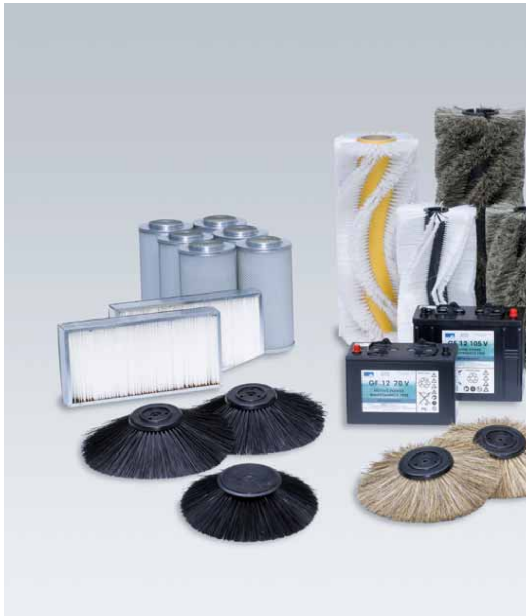
Bristles for every kind of application