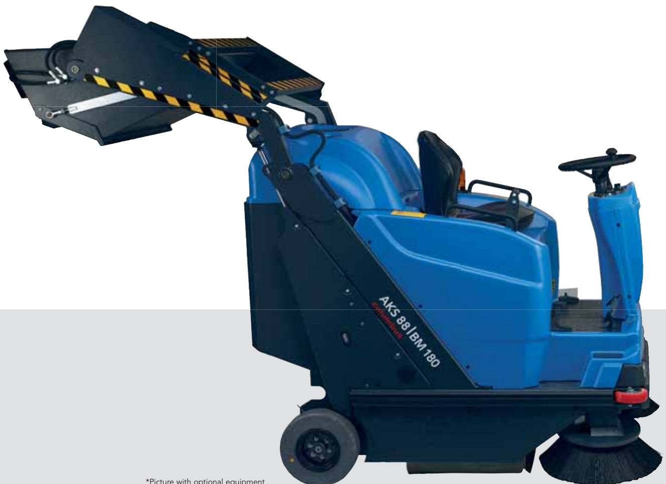
*Picture with optional equipment

** 5,5 m 2 with polyester pocket filter (standard), 8 m 2 with cylinder cartridge (optional)