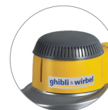
New plastic cover (L22)