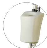
Tank 12 l