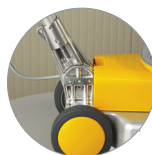
Articulation of the handle