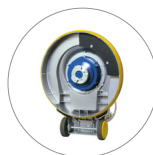
Mount for drive board and brushes