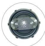
Planetary gear (L22)